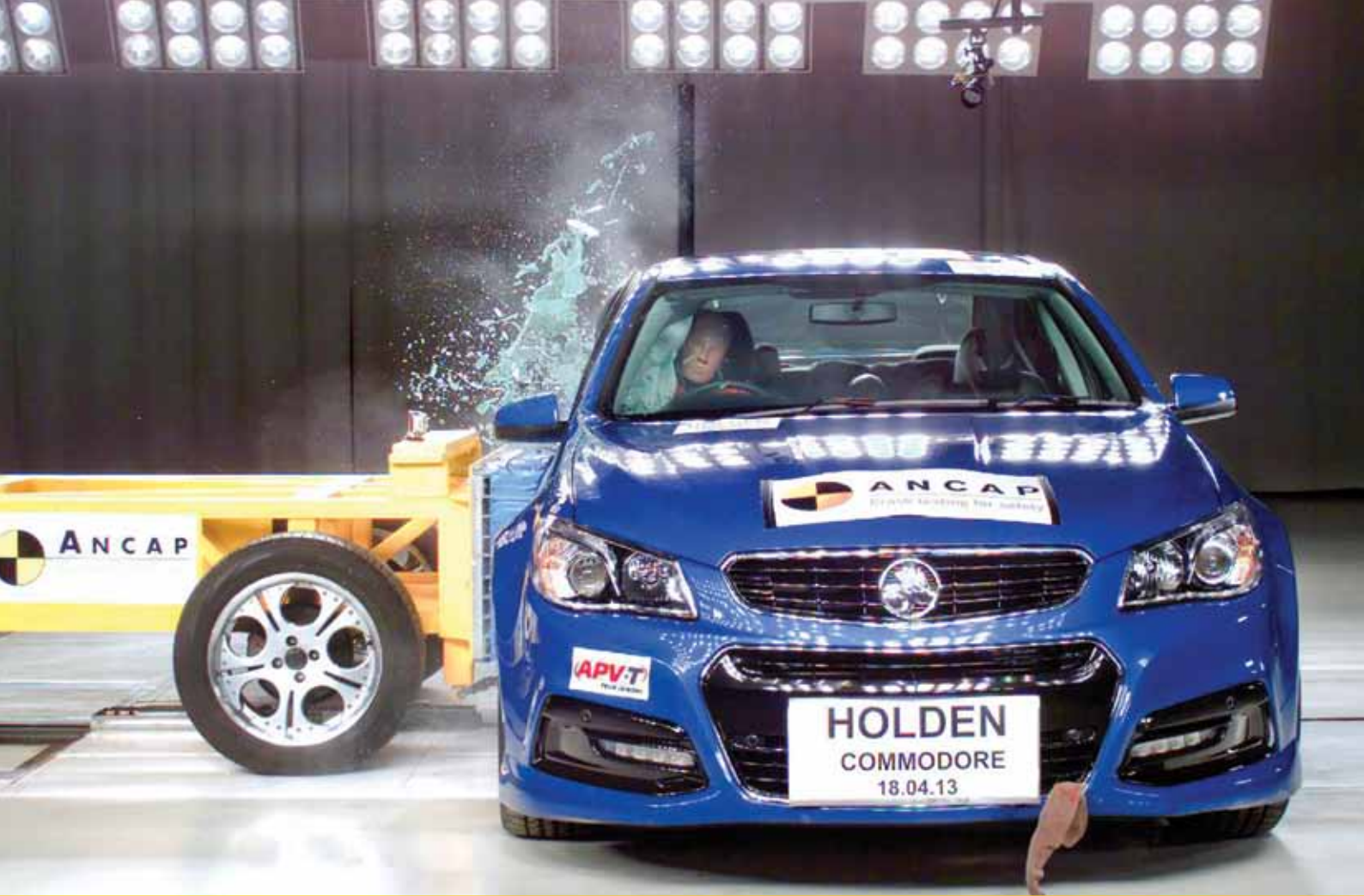
Side impact test at 50 km/h.